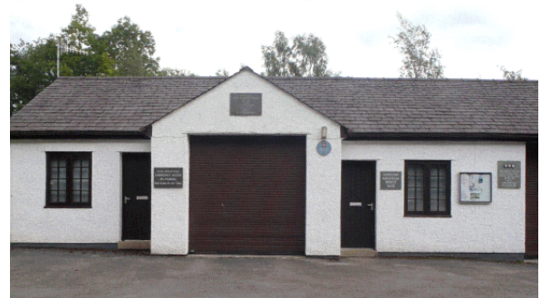
Rest Centre - Coniston Mountain Rescue Centre

Think also about the possible need for “reserve” facilities in the event that those you first identify are not available when needed and how you would manage in your selected premises if mains services are not available. You might, for example, need a generator. Talk to those responsible for the buildings you identify, secure their agreement in principal to their use and have plans in place for just how you will use them should an emergency arise.