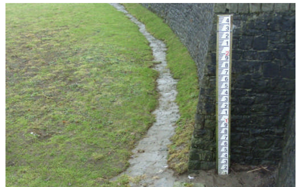
Wall marker, Keswick

Agree key sources of information and advice e.g.