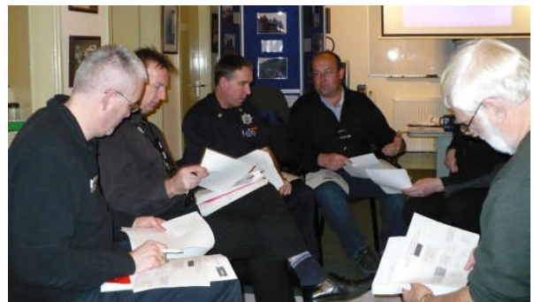
Testing Coniston Emergency Plan